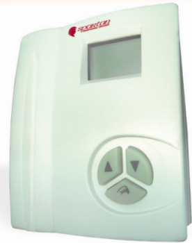
Quality, affordable electronic room thermostat with digital display